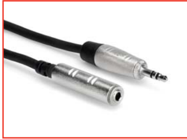
HXMM-000 Series Ideal for connecting consumer audio devices to headphones with hard-wired 3.5 mm TRS plugs