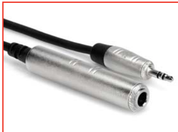
HXSM-000 Series Ideal for connecting consumer audio devices to headphones with hard-wired 1/4-inch TRS plugs