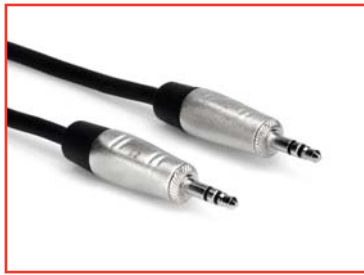
HMM-000 Series Ideal for headphones equipped with 3.5 mm TRS jacks