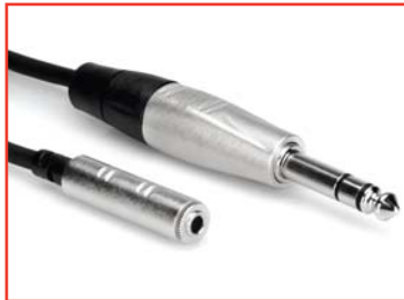
HXMS-000 Series Ideal for connecting professional audio devices to headphones equipped with hard-wired 3.5 mm TRS plugs