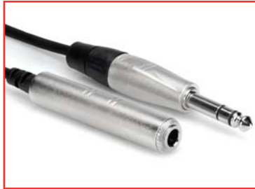
HXSS-000 Series Ideal for connecting professional audio devices to headphones with hard-wired 1/4-inch TRS plugs